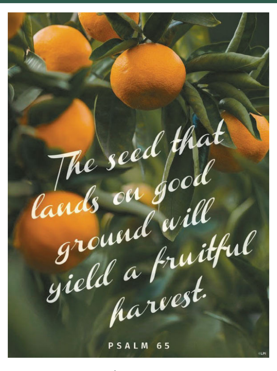
July 16, 2023 15th Sunday in Ordinary Time

We honor the traditions of our parish and welcome all to unite in prayer and the Sacraments. Loved by God and guided by the Holy Spirit, we share the good news of Jesus Christ through joyful worship, faithful formation and dedicated service.